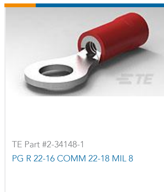
TE Part #2-34148-1 PG R 22-16 COMM 22-18 MIL 8