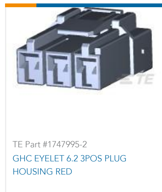
TE Part #1747995-2 GHC EYELET 6.2 3POS PLUG HOUSING RED