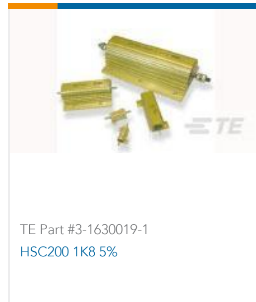
TE Part #3-1630019-1 HSC200 1K8 5%