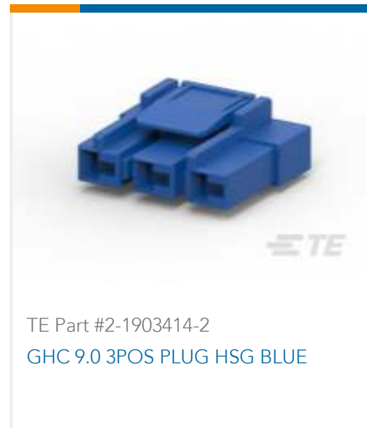
TE Part #2-1903414-2 GHC 9.0 3POS PLUG HSG BLUE