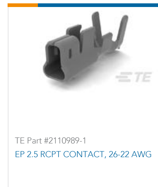
TE Part #2110989-1 EP 2.5 RCPT CONTACT, 26-22 AWG