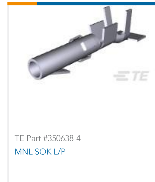
TE Part #350638-4 MNL SOK L/P