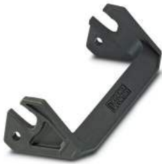
Single locking latch for B24 housing, HC-EVO....AL and HC-STA....AL

Please be informed that the data shown in this PDF document is generated from our online catalog. Please find the complete data in the user documentation. Our general terms of use for downloads are valid.