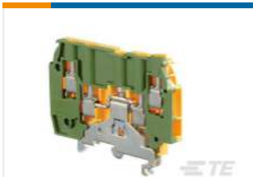
TE Part #1SNA195638R2300 M4/6.4A.P