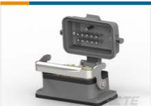
TE Part #T2120100219-000 ZGG-10DSTK,1-7,2-8,3-9,4-6,5-10