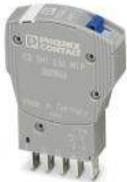
Thermomagnetic device circuit breaker, 1-pos., tripping characteristic M1 (medium-blow), 1 PDT contact, plug for base element.

Please be informed that the data shown in this PDF Document is generated from our Online Catalog. Please find the complete data in the user's documentation. Our General Terms of Use for Downloads are valid ( http://download.phoenixcontact.com )