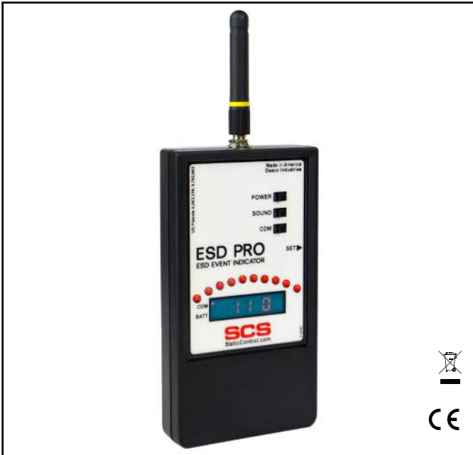
Figure 1. CTM082 ESD Pro ESD Event Indicator.