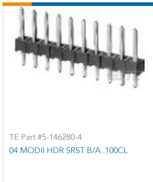
TE Part #5-146280-4 04 MODII HDR SRST B/A .100CL