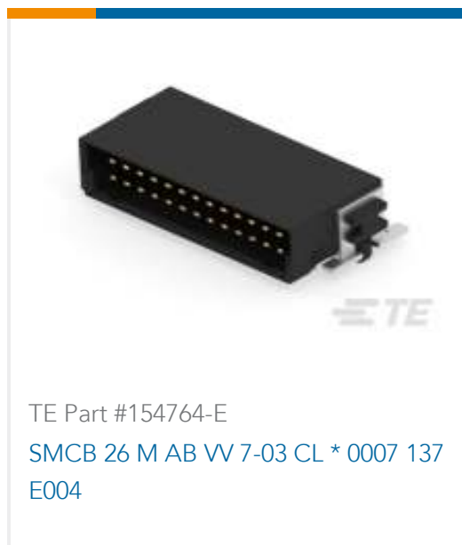
TE Part #154764-E SMCB 26 M AB W 7-03 CL * 0007 137 E004