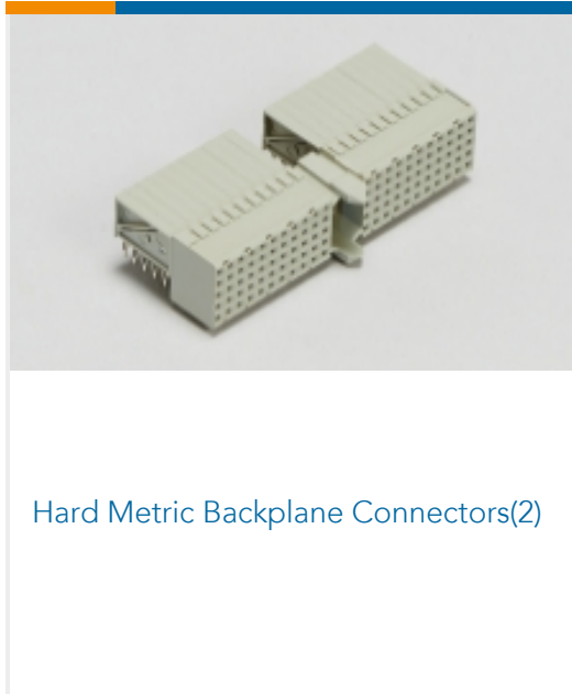
Hard Metric Backplane Connectors(2)