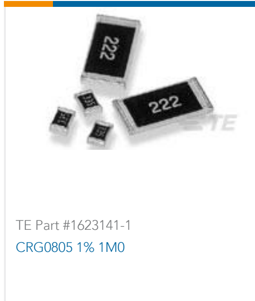
TE Part #1623141-1 CRG0805 1% 1M0