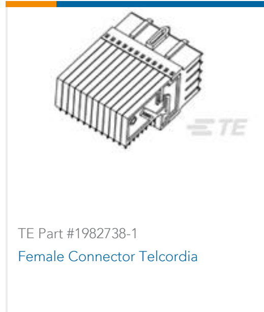
TE Part #1982738-1 Female Connector Telcordia