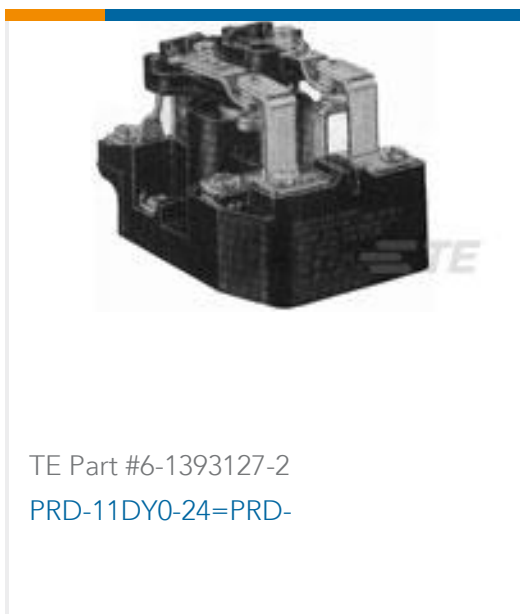
TE Part #6-1393127-2 PRD-11DY0-24=PRD-