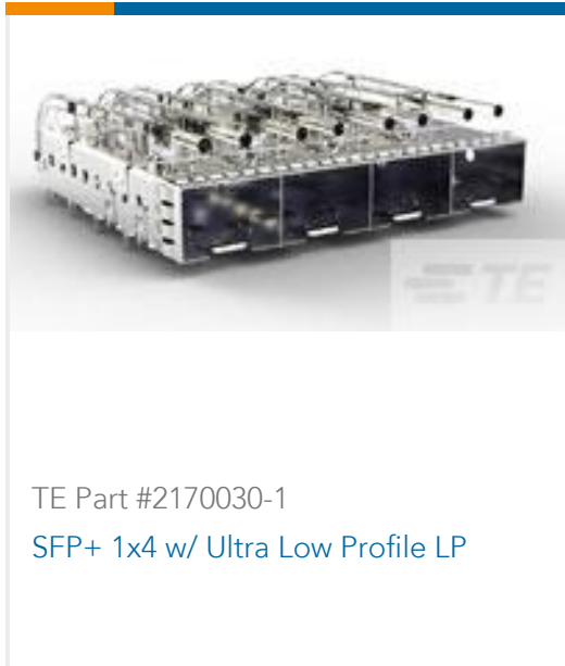
TE Part #2170030-1 SFP+ 1x4 w/ Ultra Low Profile LP