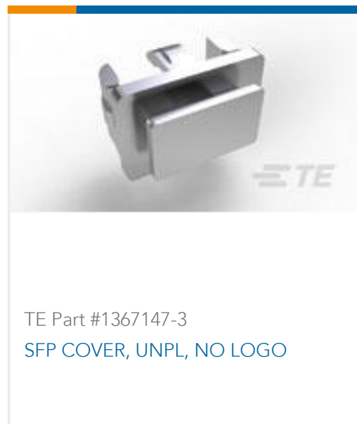
TE Part #1367147-3 SFP COVER, UNPL, NO LOGO