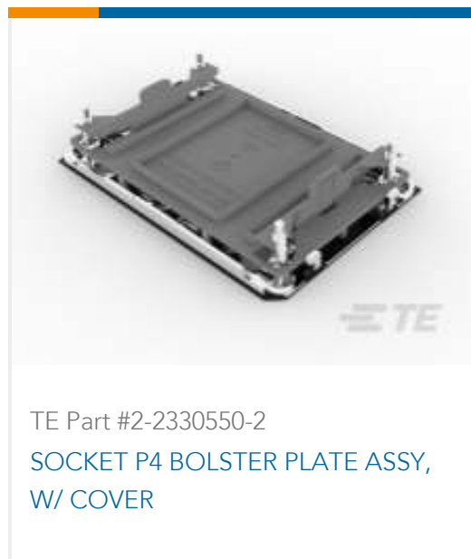
TE Part #2-2330550-2 SOCKET P4 BOLSTER PLATE ASSY, W/ COVER