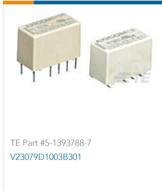
TE Part #5-1393788-7 V23079D1003B301