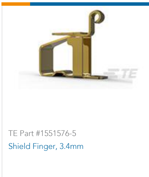
TE Part #1551576-5 Shield Finger, 3.4mm