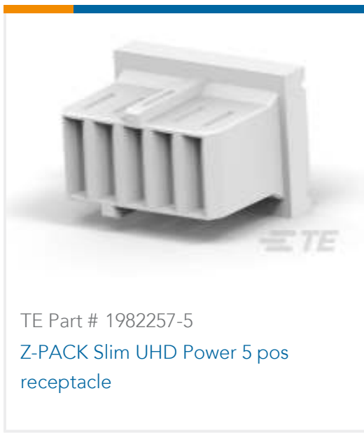
TE Part # 1982257-5 Z-PACK Slim UHD Power 5 pos receptacle