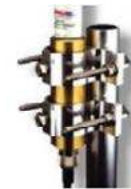
FM2 Mounting Kit (Sold separately)