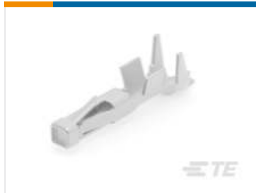
TE Part # 1-2834067-2 SOCKET CONTACT, MINIATURE WATERPROOF CONN