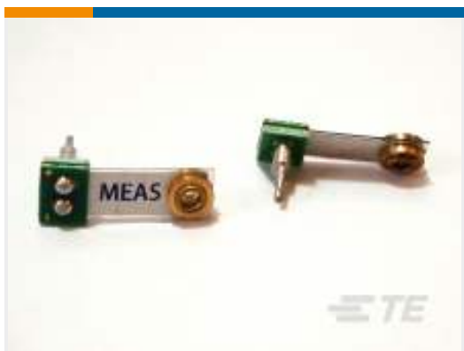
TE Part #1006015-1 LDTC-H, REDUCED HEIGHT