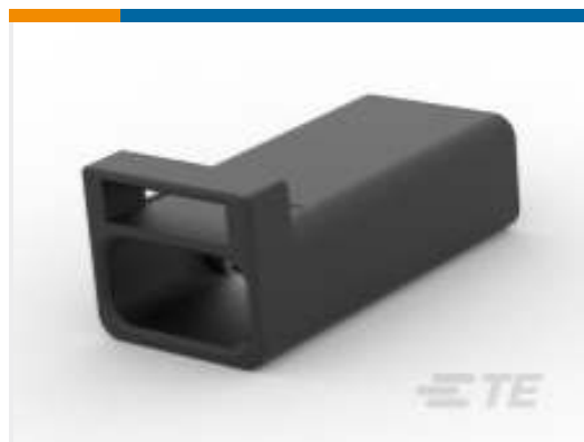
TE Part #2-2834075-2 SlimSeal Miniature Receptacles