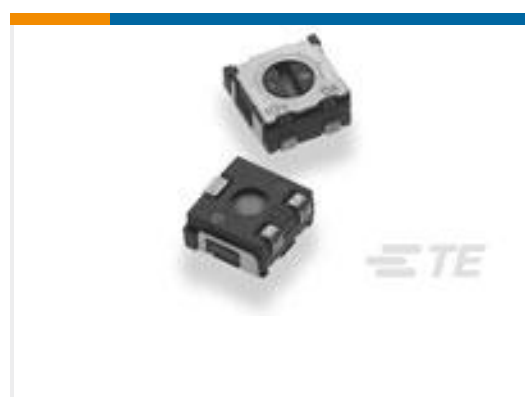
TE Part #1-1623916-0 3203X 5K