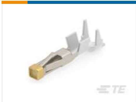
TE Part # 1-2834067-3 SOCKET CONTACT, MINIATURE WATERPROOF CONN