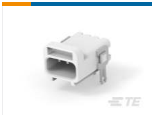
TE Part #1-2834238-1 3P REC, IP67 R/A T/H CONN, NATURE