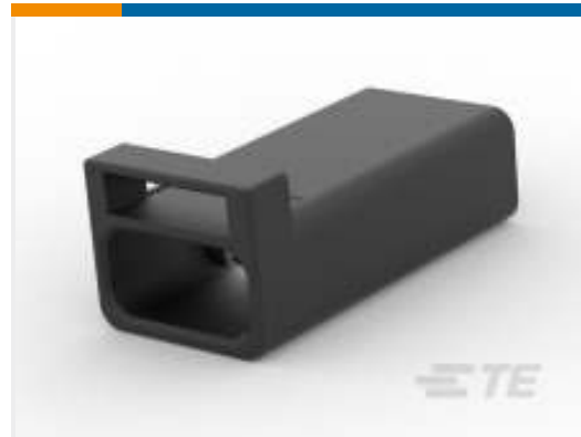
TE Part # 2-2834075-3 3P REC, MINIATURE WATERPROOF CONN, BLACK