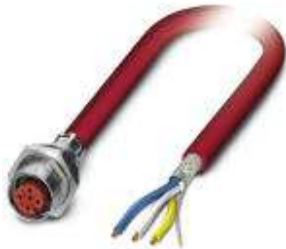
Bus system flush-type socket, CC-Link, 4-pos., M12, SPEEDCON, shielded, rear/screw mounting with Pg9 thread, with 2.0 m bus cable

Please be informed that the data shown in this PDF Document is generated from our Online Catalog. Please find the complete data in the user's documentation. Our General Terms of Use for Downloads are valid ( http://download.phoenixcontact.com )