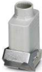
Coupling housing with single locking engagement nose, for HC-COM-K-KV-PG16...screw connection

Please be informed that the data shown in this PDF Document is generated from our Online Catalog. Please find the complete data in the user's documentation. Our General Terms of Use for Downloads are valid ( http://download.phoenixcontact.com )