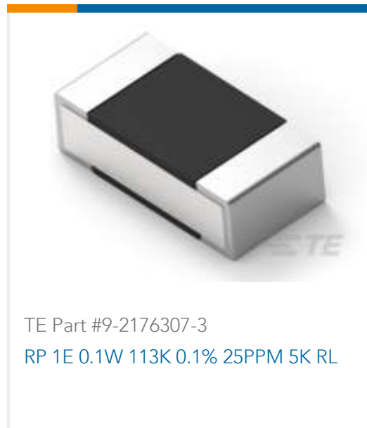
TE Part #9-2176307-3 RP 1E 0.1W 113K 0.1% 25PPM 5K RL