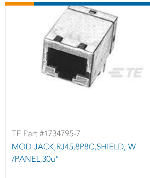
TE Part #1734795-7 MOD JACK,RJ45,8P8C,SHIELD, W /PANEL,30u"