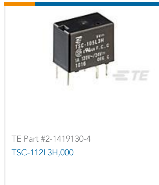
TE Part #2-1419130-4 TSC-112L3H,000