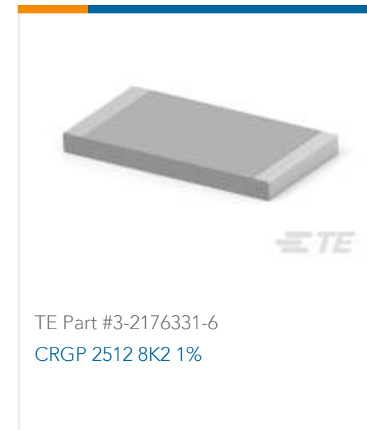
TE Part #3-2176331-6 CRGP 2512 8K2 1% /PANEL,30u"