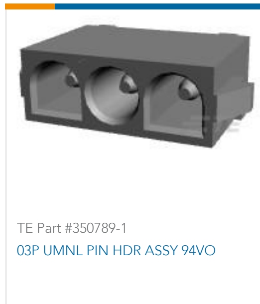
TE Part #350789-1 03P UMNL PIN HDR ASSY 94VO