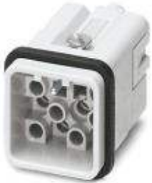
HEAVYCON plug insert, Q12 series, 12-pos., crimp connection, with coding option.

Please be informed that the data shown in this PDF Document is generated from our Online Catalog. Please find the complete data in the user's documentation. Our General Terms of Use for Downloads are valid ( http://phoenixcontact.com/download )