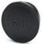
Plastic dust protection cap, anti-static, for RF, SF series connectors, with M23 external thread

Plastic anti-static dust protection cap - RC-Z2469 - 1611797