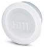
Plastic dust protection cap for connectors with M23 knurled nuts

Plastic dust protection cap - RC-Z2058 - 1604223