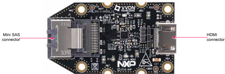
Figure 3: MIPI-DSI to HDMI Adaptor Card (included in the EVK) Note: (Color of the adaptor card may differ)