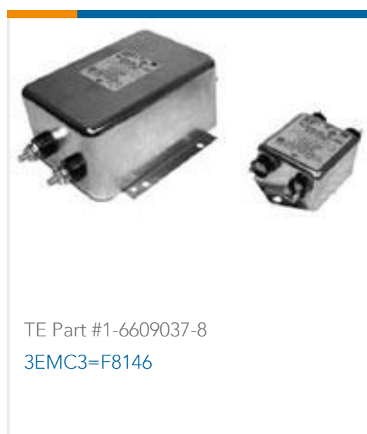
TE Part #1-6609037-8 3EMC3=F8146