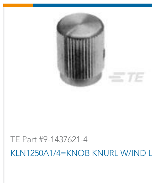
TE Part #9-1437621-4 KLN1250A1/4=KNOB KNURL W/IND L