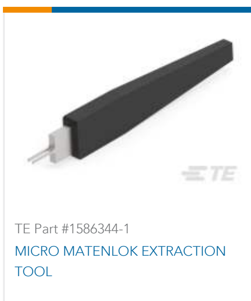
TE Part #1586344-1 MICRO MATE-N-LOK EXTRACTION TOOL