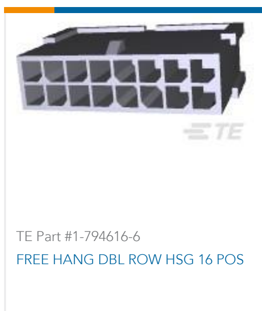
TE Part #1-794616-6 FREE HANG DBL ROW HSG 16 POS