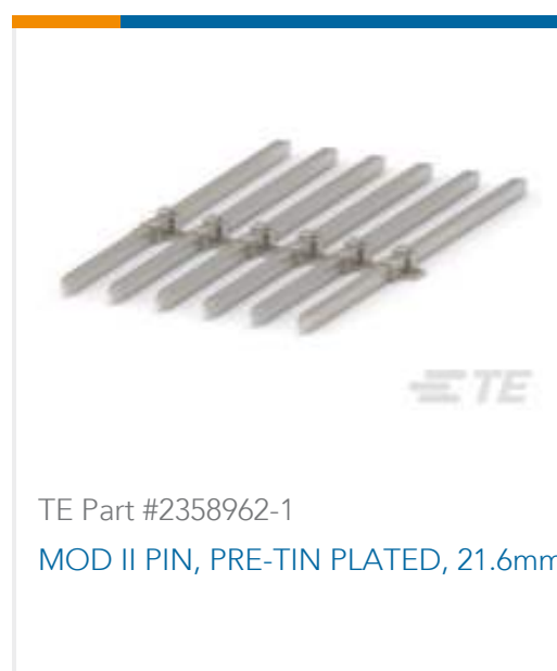
TE Part #2358962-1 MOD II PIN, PRE-TIN PLATED, 21.6mm