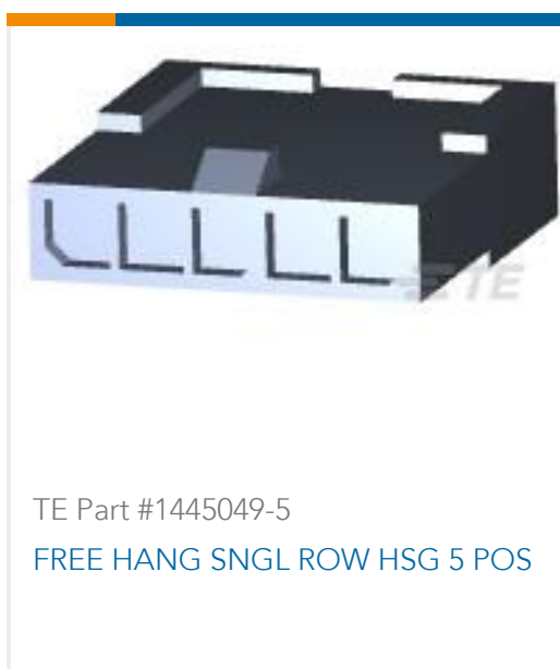
TE Part #1445049-5 FREE HANG SNGL ROW HSG 5 POS