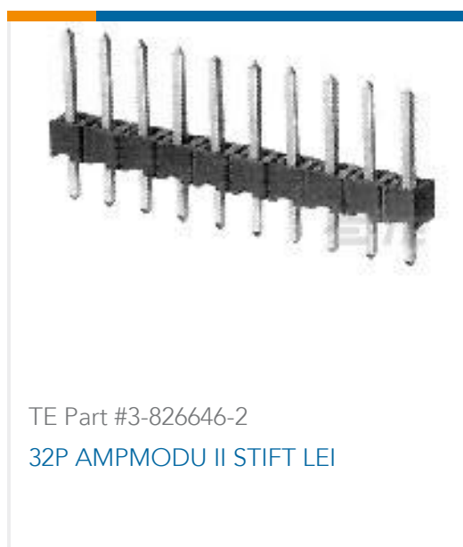
TE Part #3-826646-2 32P AMPMODU II STIFT LEI