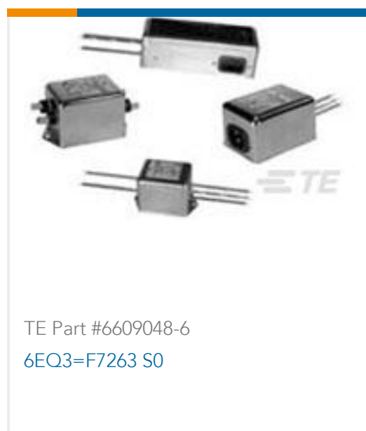
TE Part #6609048-6 6EQ3=F7263 S0