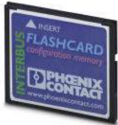
Program and configuration memory, plug-in, 256 MB

Please be informed that the data shown in this PDF Document is generated from our Online Catalog. Please find the complete data in the user's documentation. Our General Terms of Use for Downloads are valid ( http://download.phoenixcontact.com )