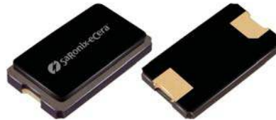
8.0 x 4.5mm Ceramic SMD