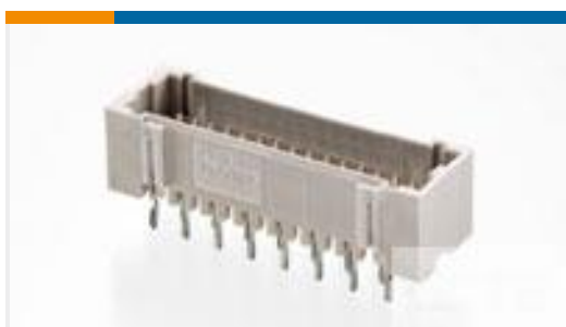
TE Part #2-292208-4 MINI CT D/R DIP 24P V NAT