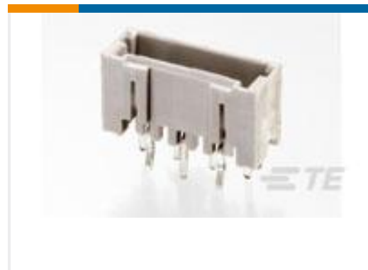
TE Part #292207-9 MINI CT SGL DIP V 9P NAT