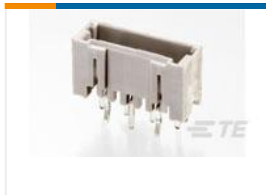
TE Part #1-292207-2 MINI CT SGL DIP V 12P NAT