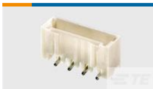
TE Part #1-292231-2 1.5 MINI CT SGL V SMT W/O BOSS