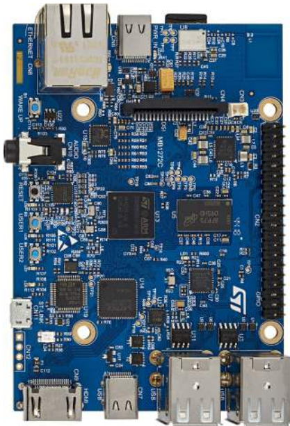
STM32MP157F-DK2 top view with display removed. Picture is not contractual.