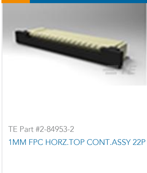
TE Part #2-84953-2 1MM FPC HORZ.TOP CONT.ASSY 22P