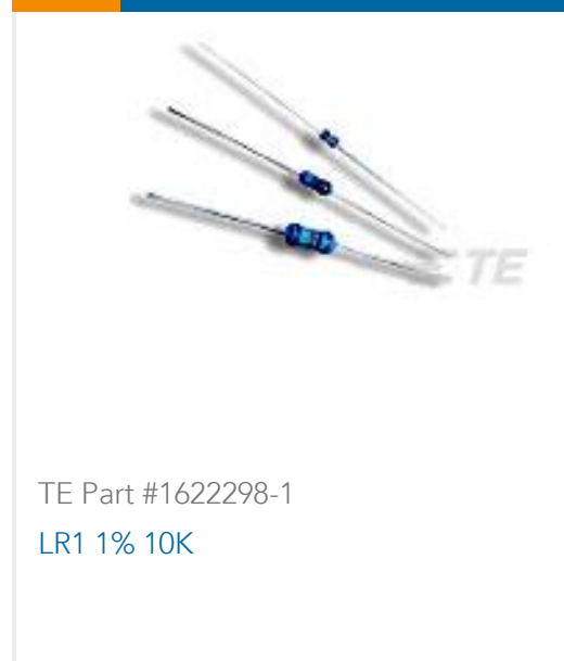
TE Part #1622298-1 LR1 1% 10K