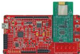
Fig 4: Programming and debugging with CY8CKIT-042-BLE BLE Pioneer Kit Baseboard

Note: Jumper on CYBLE-012011-EVAL's J3 header can be connected or disconnected.