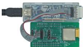
Fig 3: Programming/Debugging with MiniProg3

Connect the MiniProg3 to the J4 10-pin header