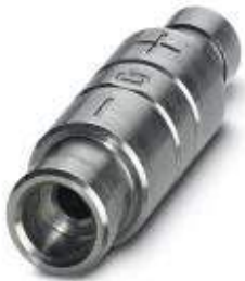
Crimp head positioner

Please be informed that the data shown in this PDF Document is generated from our Online Catalog. Please find the complete data in the user's documentation. Our General Terms of Use for Downloads are valid ( http://phoenixcontact.com/download )