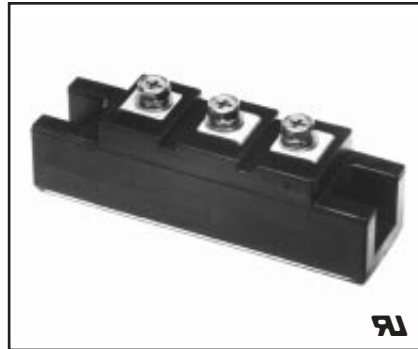
CD411230, CD411630 Dual Diode POW-R-BLOK™ Modules 30 Amperes/1200-1600 Volts