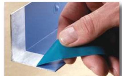
Clean removal, sharp paint edge.