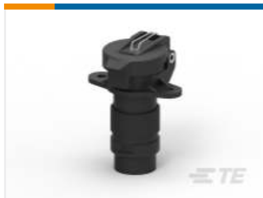
TE Part #CAR2SC68 CAR RECPT DIN9680 2way, IP68