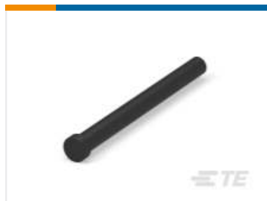
TE Part #2236369-1 61103 DVI LOCKING SEALING PLUG #16