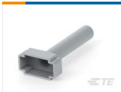
TE Part #DTM8S-BT BOOT, 8P, PLG, ST, GRY