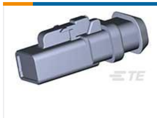
TE Part #DTP06-2S-EE01 PLG, 2P, BLK, N, XCAP