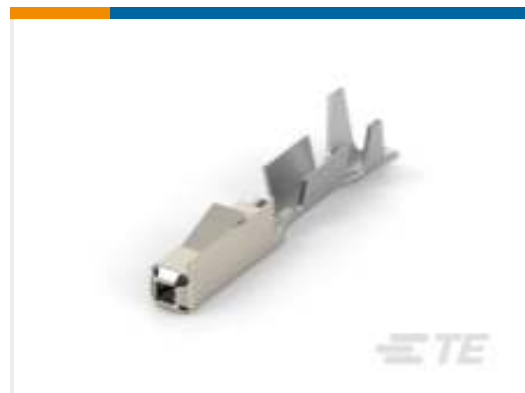
TE Part #5-963729-1 MQS SOCKET CONTACT