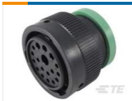
TE Part #HDP26-24-18SN-L017 PLG, 18P, BLK, N, RNG, 8/12/16, S