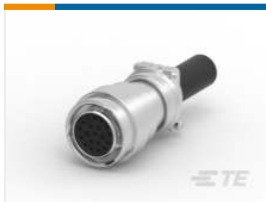
TE Part #HD36-18-20SN-059 PLG,20P,AL,N,CBLCLMP BT,DRAIN,16 /20,S,MC