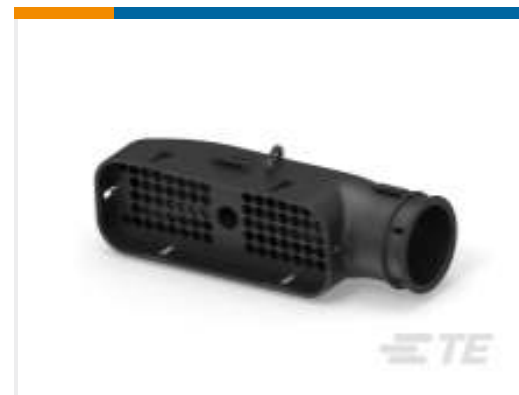
TE Part #0528-012-7005 BKSHL, 70P, BLK, PLG, RA, NO RIB, NW 26