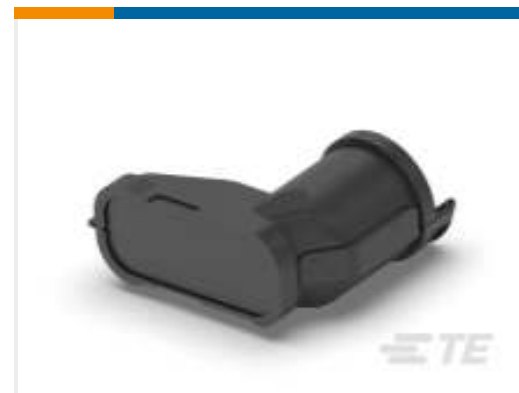
TE Part #SRK-BS-MD-ST-001 BKSHL, MED, BLK, ST, NW 17/22