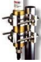
FM2 MOUNTING KIT (SOLD SEPARATELY)