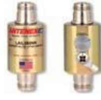
LABH350NN (SOLD SEPARATELY)