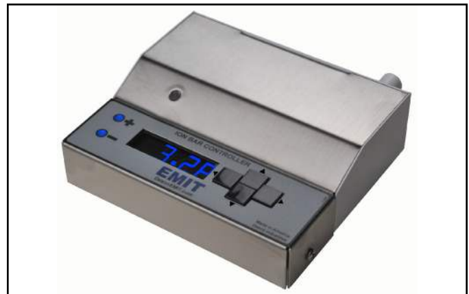
Figure 6. EMIT 50855 Controller with Digital Adjustment