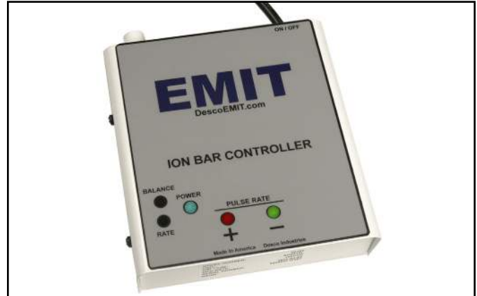
Figure 4. EMIT 50940 Controller with Recessed Potentiometer Adjustment