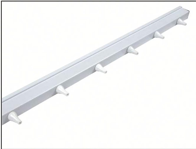
Figure 1. EMIT Air Assisted Ion Bar