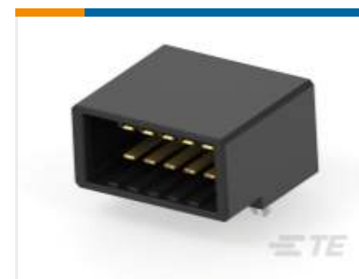
TE Part #1-178317-2 Header Assembly: Wire-to-Board, 15A, gold or tin plated