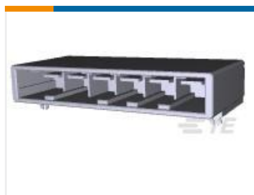
TE Part #1-179959-2 DYNAMIC D-5200 HDR ASSY 6P H X