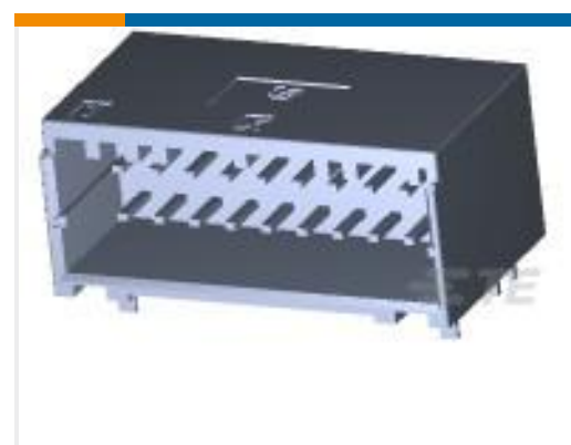
TE Part #1-1827876-0 DYNAMIC 1200D HDR ASSY H 20PX BLACK GOLD