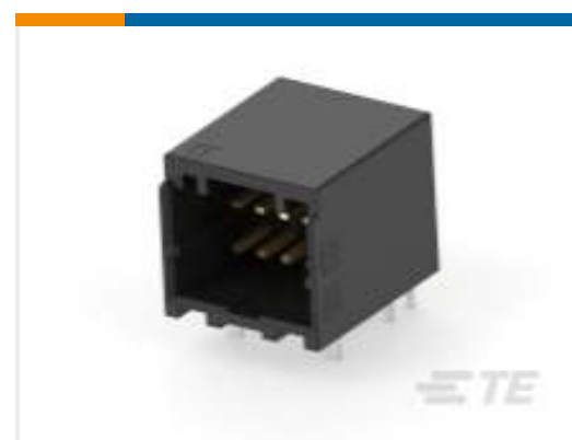
TE Part #1-1827872-1 Header Assembly: Wire-to-Board, 3A, Gold or Tin Plated