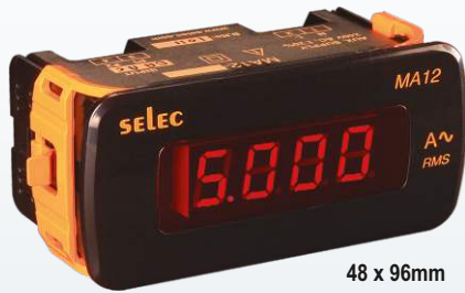
48 x 96mm