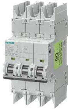
Circuit breaker 10kA, 3-pole, C, 2A according to UL 489-480Y/277V