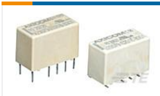
TE Part #3-1393789-5 V23079A2001B301