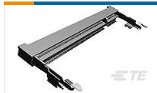
TE Part #1-1473005-1 SEMI HARD TRAY DDR SOCKET 200P