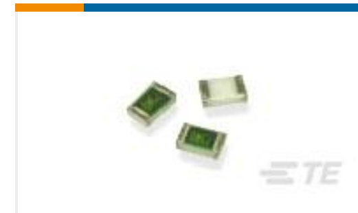
TE Part #9-2176091-7 RP 2A 0.25W 604R 0.1% 25PPM 1K RL