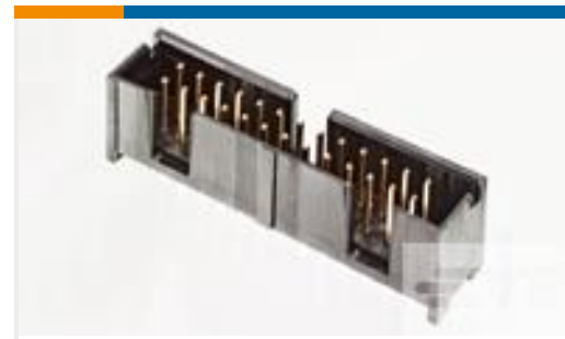
TE Part #2-1761603-7 IDC LOW PRO HDR 20P VERT BLUE