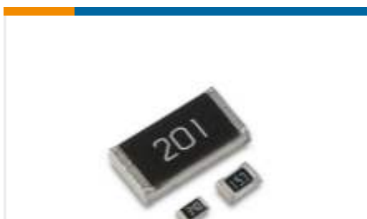
TE Part #1-2176326-7 CRGP 0603 220R 1%