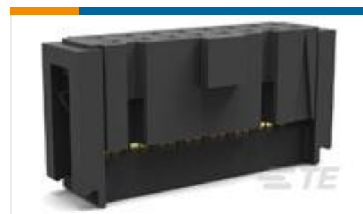
TE Part #1658527-7 622-1641LF FEM SOCKET, LEAD FREE