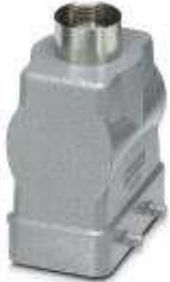
HEAVYCON B10 sleeve housing, for double locking latch, height: 72 mm, with 1 x M25 gland, straight cable outlet

Please be informed that the data shown in this PDF Document is generated from our Online Catalog. Please find the complete data in the user's documentation. Our General Terms of Use for Downloads are valid ( http://download.phoenixcontact.com )