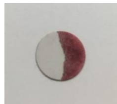
t = 60 sec

1 drop of water place at edge of ½” diameter circle @ t = 0 sec