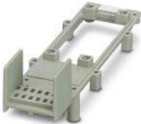
Plug receptacle, for plug assembly board, with strain relief, for accommodating contact inserts, type B16

Please be informed that the data shown in this PDF Document is generated from our Online Catalog. Please find the complete data in the user's documentation. Our General Terms of Use for Downloads are valid ( http://download.phoenixcontact.com )