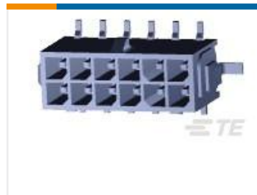
TE Part #4-794636-2 12P MICRO MNL ASSY,VRT,SMT,LF