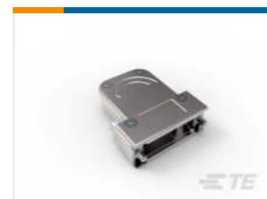
TE Part #1-2308341-3 FULL METAL HOODS SIZE 2-3 (RAW 180 DEG)