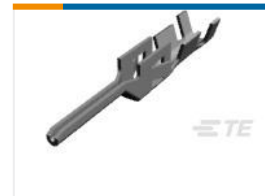
TE Part #1-794612-0 PIN CONT 20-24 TIN PLATE L/P