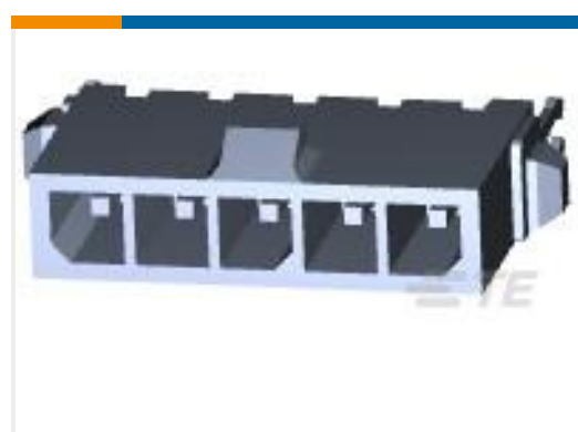
TE Part #2-1445094-5 MICRO MNL HDR ASSY S/ROW AU LF