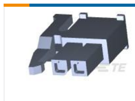
TE Part #2029047-2 2P MICRO MNL RCPT HSG SR SIDE