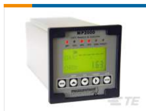
TE Part #02291335-000 MP-2000 DUAL CHANNEL SIG COND