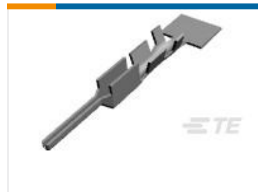
TE Part #1-794608-0 PIN CONT 20-24 TIN PLATE STRIP