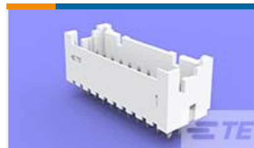
TE Part #1-1969570-2 ASSY,HDR,VERT,GWT,BOSSED,DUAL ROW, EP2.5