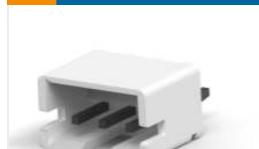
TE Part #440054-8 AMP HPI 2.0 mm Headers