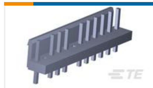
TE Part #1-1744524-2 EP 12P HEADER ASY NO 2,6 PINS