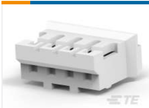
TE Part # CAT-H857-H817220 AMP HPI 2.0 mm Receptacle Housings