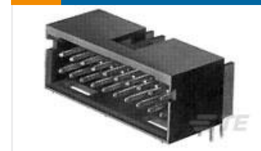
TE Part #5-102617-2 08 MODII HDR DRRA SHRD LF