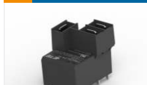
TE Part #1558677-7 T9GS2L24-24