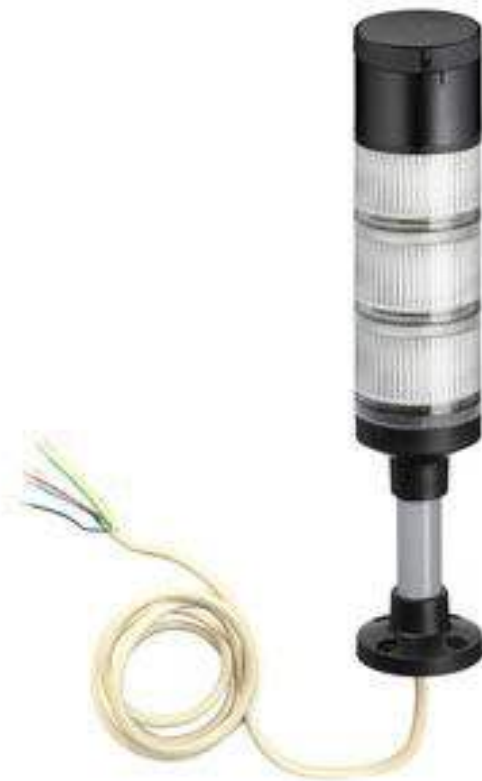
Figure can vary