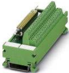
VARIOFACE module, with screw connection and D-subminiature socket strip, for assembly on NS 35/7.5, 9 positions

Please be informed that the data shown in this PDF Document is generated from our Online Catalog. Please find the complete data in the user's documentation. Our General Terms of Use for Downloads are valid ( http://download.phoenixcontact.com )