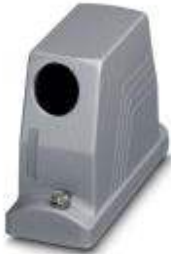
HEAVYCON ADVANCE EMV sleeve housing B24, with screw locking, height 100 mm, with 1xM40 thread, lateral cable outlet

Please be informed that the data shown in this PDF Document is generated from our Online Catalog. Please find the complete data in the user's documentation. Our General Terms of Use for Downloads are valid ( http://download.phoenixcontact.com )