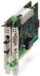
Termination board - system coupler with copper connection

Please be informed that the data shown in this PDF Document is generated from our Online Catalog. Please find the complete data in the user's documentation. Our General Terms of Use for Downloads are valid ( http://phoenixcontact.com/download )