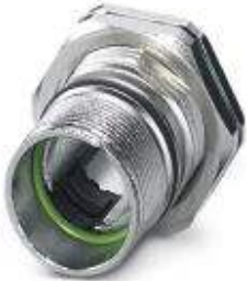
Device connector, rear mounting, straight, SPEEDCON locking, M23, Seal, axial, Central fixing, shielded: yes

Please be informed that the data shown in this PDF Document is generated from our Online Catalog. Please find the complete data in the user's documentation. Our General Terms of Use for Downloads are valid ( http://phoenixcontact.com/download )