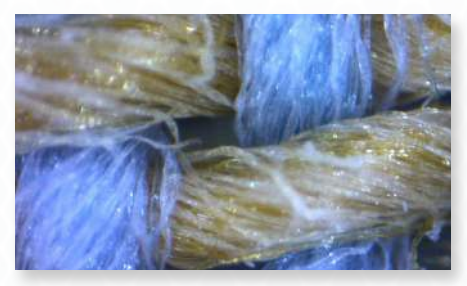
Excellent Color Reproduction