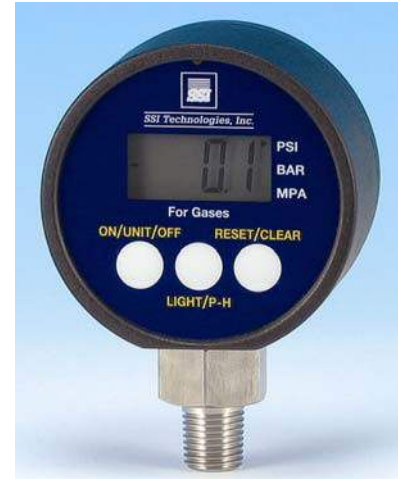
MediaGauge™ Model MGA-9V with rubber boot option