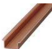
DIN rail, material: Copper, unperforated, 1.5 mm thick, height 15 mm, width 35 mm, length: 2 m

DIN rail - NS 35/15 CU UNPERF 2000MM - 1201895