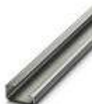
G-profile DIN rail, material: Steel, unperforated, height 15 mm, width 32 mm, length 2 m

DIN rail - NS 32 UNPERF 2000MM - 1201015