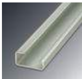
G rail 32 mm (NS 32)

DIN rail - NS 32 AL UNPERF 2000MM - 1201028