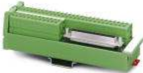
The illustration shows the version UM 25-D 9SUB/B/FRONT/Q

VARIOFACE SLIM LINE, with screw connection and D-subminiature pin strip, for assembly at a right angle on NS 35/7.5, 37 positions