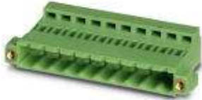
The illustration shows a 15-position version

Please be informed that the data shown in this PDF Document is generated from our Online Catalog. Please find the complete data in the user's documentation. Our General Terms of Use for Downloads are valid ( http://phoenixcontact.com/download )