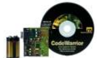
Motorola's comprehensive development tools make it simple to incorporate HC08 Q microcontrollers into your designs.