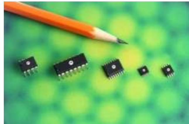
The HC08 Q family offers a variety of low-pin-count, low cost package options.