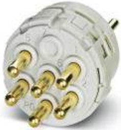
Contact insert, Number of positions: 6, Type of contact: Male connector, Solder-in connection

Please be informed that the data shown in this PDF Document is generated from our Online Catalog. Please find the complete data in the user's documentation. Our General Terms of Use for Downloads are valid ( http://phoenixcontact.com/download )