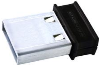
Figure 1: BLED112 Bluetooth Low Energy USB dongle

BLED112 Bluetooth Low Energy Dongle integrates all Bluetooth Low Energy features. The USB dongle can a virtual COM port that enables simple host application development using a simple application programming interface. The BLED112 can be used for Bluetooth Low Energy development. With two BLED112 dongles you can quickly prototype new Bluetooth Low Energy application profiles by utilizing Bluegiga Profile Toolkit™ and also automate in module software functions with Bluegiga BGScript™.