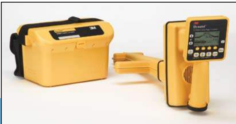
3M™ Dynatel™ Cable/Pipe Locator 2250M