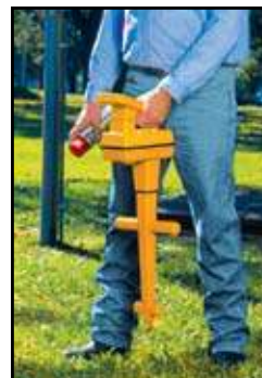
3M™ Dynatel™ Cable/Pipe Locator 2250M

* When connected to standard NMEA compliant GPS devices.